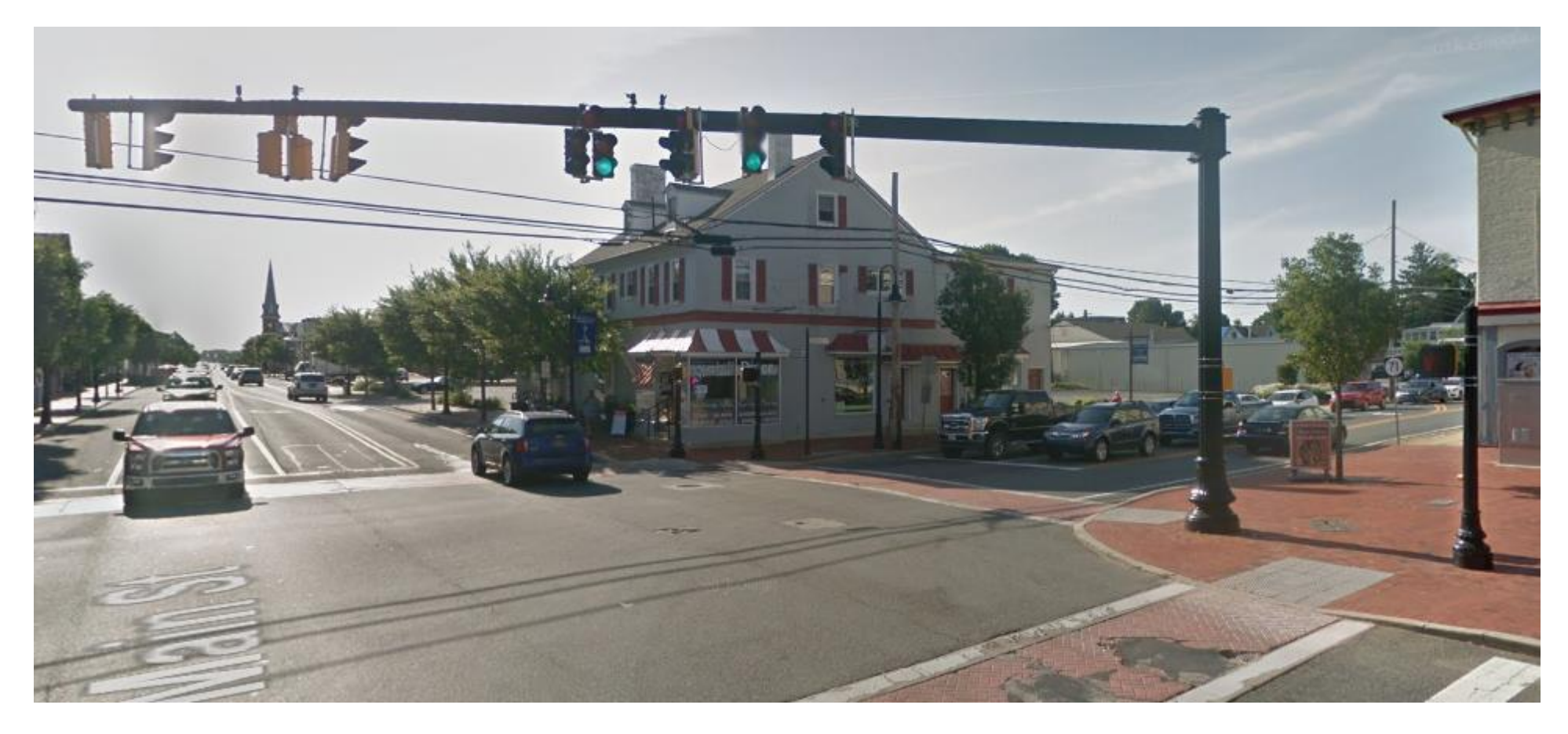
Main Street and Broad Street in Middletown. The poles shown are ornamental with the ornamental base.