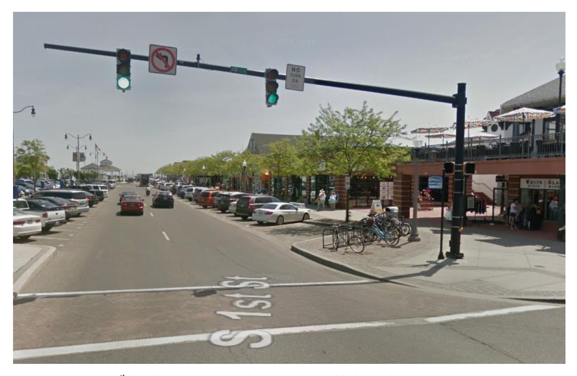
Rehoboth Avenue and 1st Street in Rehoboth. The pole and mast arm are black-coated standard poles.